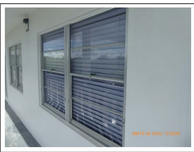
#7 OPENING PROTECTION WINDOWS ARE NOT PROTECTED