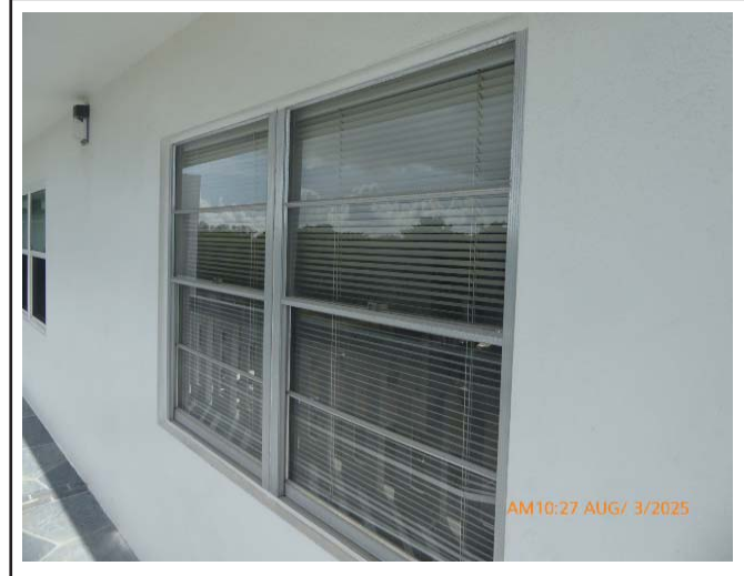
#7 OPENING PROTECTION WINDOWS ARE NOT PROTECTED