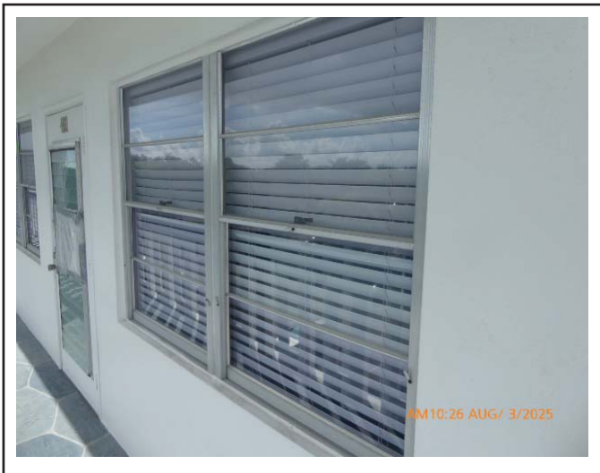
#7 OPENING PROTECTION WINDOWS ARE NOT PROTECTED