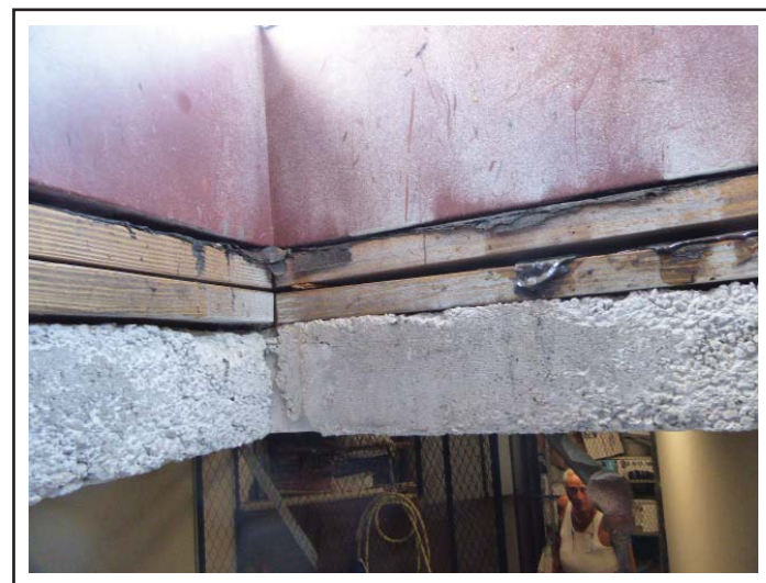
CEMENT ROOF VERIFICATION

The effective year built for this property is 1978. The actual year built for this property is 1977.