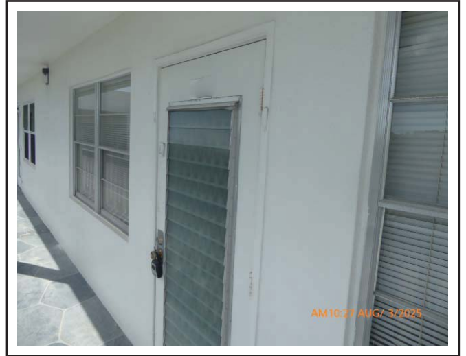
#7 OPENING PROTECTION DOORS NOT TO CODE