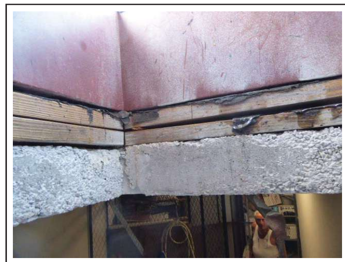
CEMENT ROOF VERIFICATION

The effective year built for this property is 1978. The actual year built for this property is 1977.